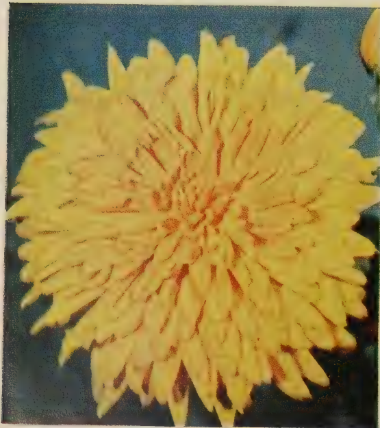
HOLIDAY. 75c each; 3 for $2.00